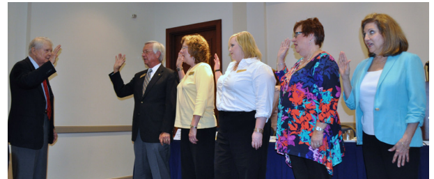
Photos from the swearing in ceremony